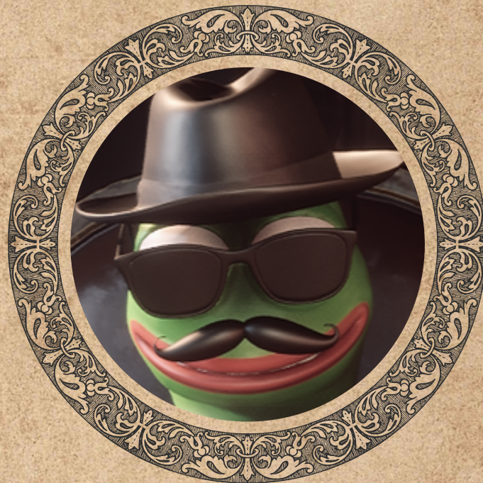
“ Don Pepe Mob Boss @TheDonPepe

"Harness the power of meme culture, combining it with the enduring strength of mafia bonds to create a unique token." - Don Pepe.