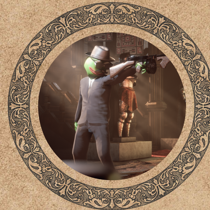
“ Spurdo Spärde Henchman @SpurdoSparde

"Harness the power of meme culture, combining it with the enduring strength of mafia bonds to create a unique token." - Don Pepe.